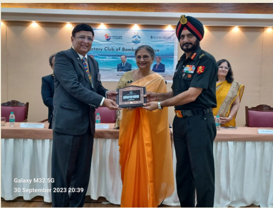
Galaxy M32 5G 30 September 2023 20:39