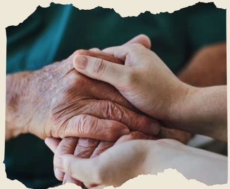
GLOBAL GRANT PROJECT