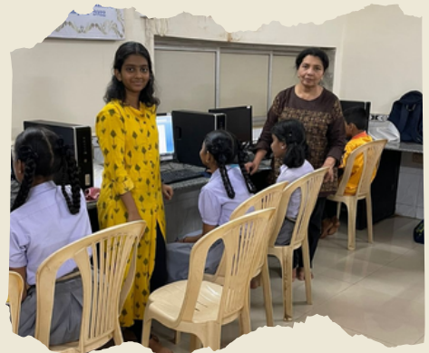
YUSUF MEHERALLY PROJECT