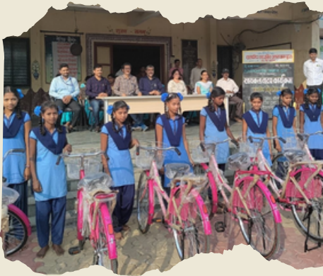
MODEL VILLAGE IN PALGHAR