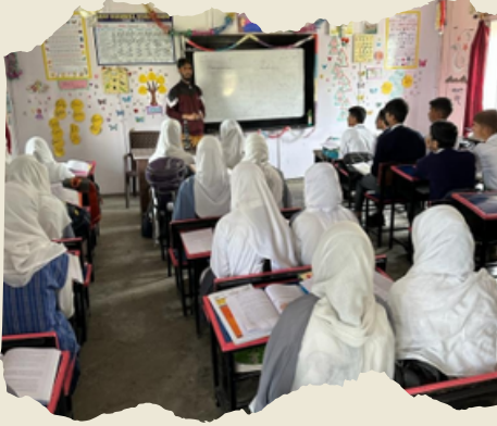
NATIONAL INTEGRATION PROJECT