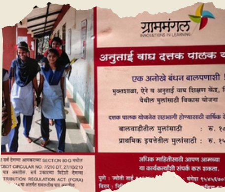
GRAMMANGAL SCHOOL AT AINA